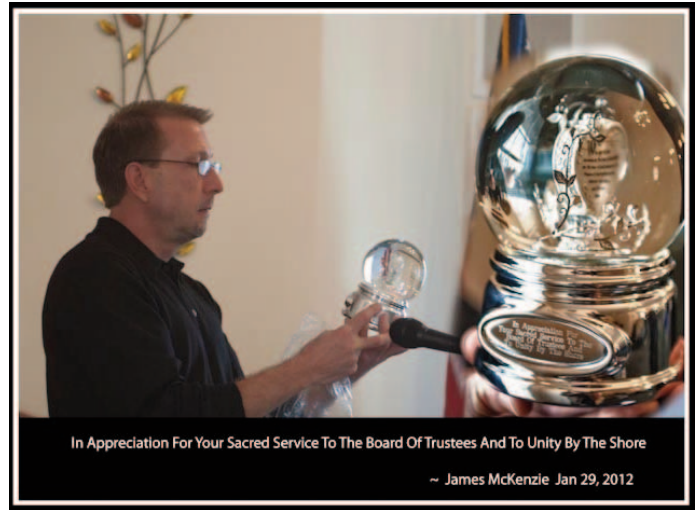
In Appreciation For Your Sacred Service To The Board Of Trustees And To Unity By The Shore